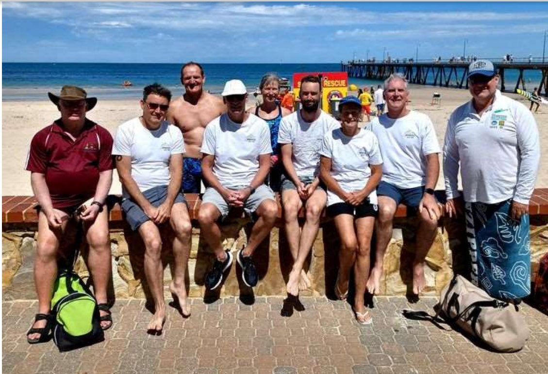
Marion Marlins who competed at the Proclamation Classic on 28 December 2023