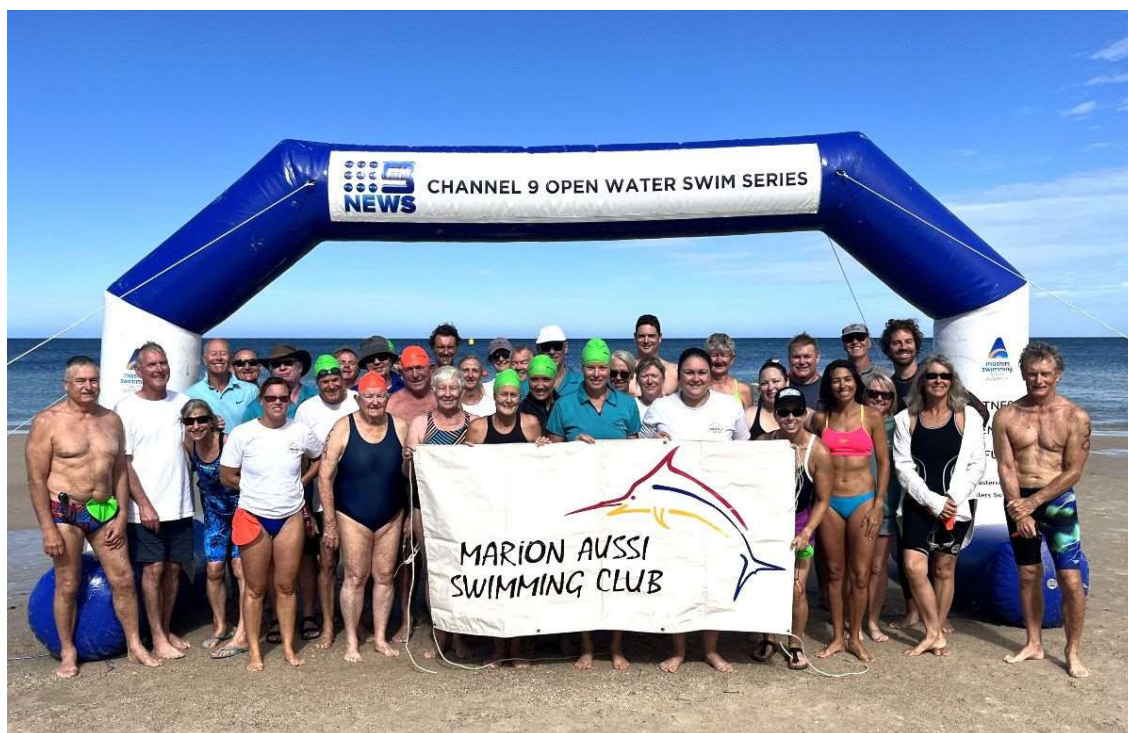
Marion Marlins Team Photo State Masters Open Water Swim Championships 14 January 2024

Trenwith at Mark.Trenwith@outlook.com or 0408 262 540.